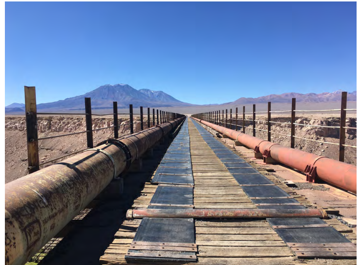
Conchi Viaduct over the Loa River; Northern Chile.

Key goals I have in mind for the term 2025-28 and the renewed Board include implementing a more collaborative and shared workflow, rethinking TICCIH programmatically as a global community, and professionalising our work as the world’s leading organisation for industrial heritage. I will return to the programmatic aspects of this in more detail at a later time, after my official inauguration as