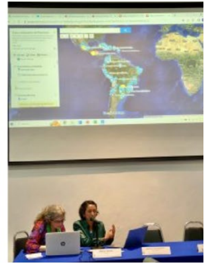
MapaPI hybrid session at the Latin American TICCIH Congress 2023 in Monterrey, 26 October 2023.

on 3 February 2023, we developed an initial theoretical framework, defined scope objectives and chose the cartographic platform.