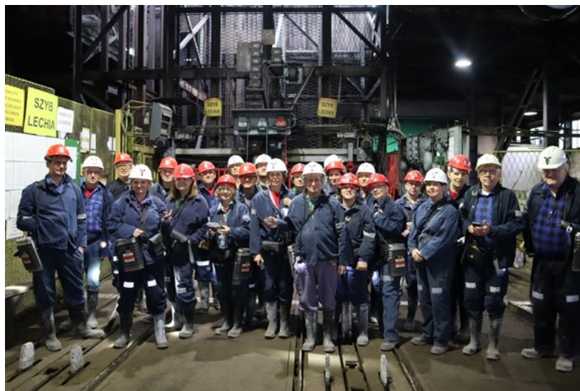
Visiting Group of delegates at the Staszic-Wujek Coal Mine